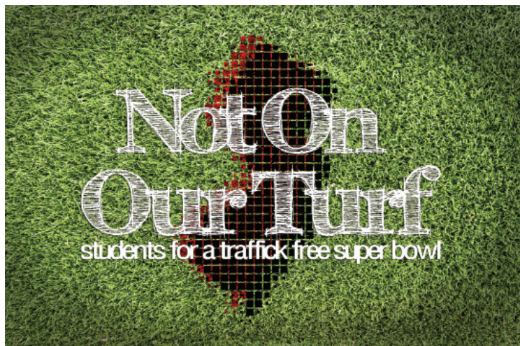
Campaign developed by student activists with Project Stay Gold

On May 6 2013, Governor Chris Christie signed the Human Trafficking Prevention, Protection, and Treatment Act into law giving New Jersey one of the toughest anti-trafficking laws in the United States, significantly strengthening the penalties for trafficking. State law enforcement acknowledges that NJ has a serious human trafficking issue.