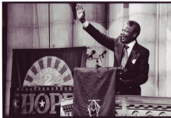
Nelson Mandela, Riverside Church NYC, 1990

essary as it was in 1994” to “give substance and shape to the vision and energies of [South Africa’s] people.” Mandela’s words that night still ring true: “We look forward to continuing that work which is based on a shared interest.” Today we continue his long, unfinished walk to freedom by creating viable communities, farms, enterprises, homes, jobs – and laying economic foundations for an equitable South Africa, and a more just and peaceful world.