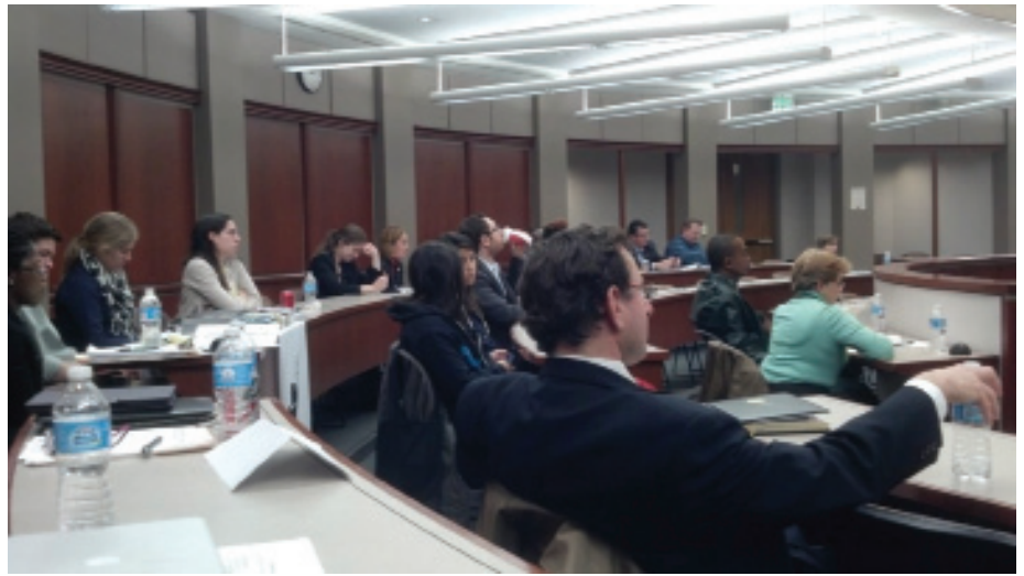
Hotel managers undergo anti-trafficking training at Rutgers University