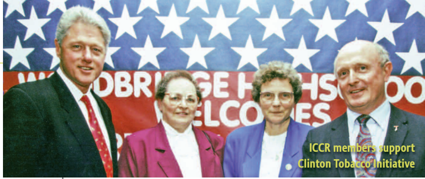
ICCR members support Clinton Tobacco Initiative