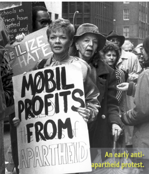
An early anti-apartheid protest.

During the 20th century the international centers of power began shifting from the capitals of national governments to the headquarters and boardrooms of the world's biggest companies. Corporations and the capital they wielded developed an extraordinary influence on global economies, government policies and hence, people and the environment.