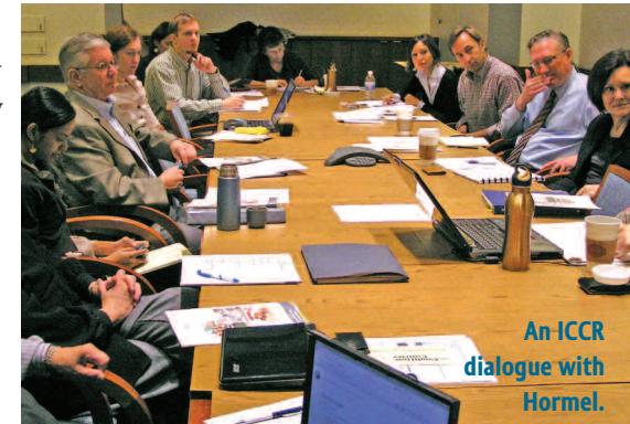
An ICCR dialogue with Hormel.

In the course of 40 years, the CSR movement has developed into a serious field, as evidenced by the explosion of "social" investment firms and the burgeoning CSR staffs at most Fortune 500 companies. Helping to drive this growth is a demand for "green," "fair trade" and "ethically sourced" products, and discriminating investors who only buy stock in companies able to meet increasingly stringent ESG standards. These investors are empowered in their choices by a proliferation of organizations dedicated to promoting shareholder advocacy.