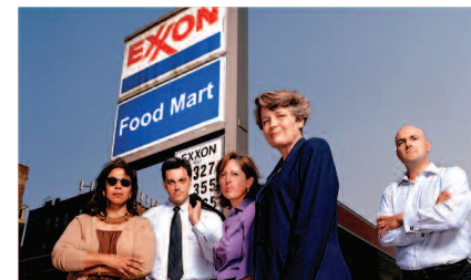
ICCR members tackle Exxon Mobil.

holder proposals to win investor support of 30 percent or more, the practice of filing resolutions is gradually being replaced by productive investor dialogues. By 2010, professionally managed assets following SRI strategies were valued at $3.07 trillion.